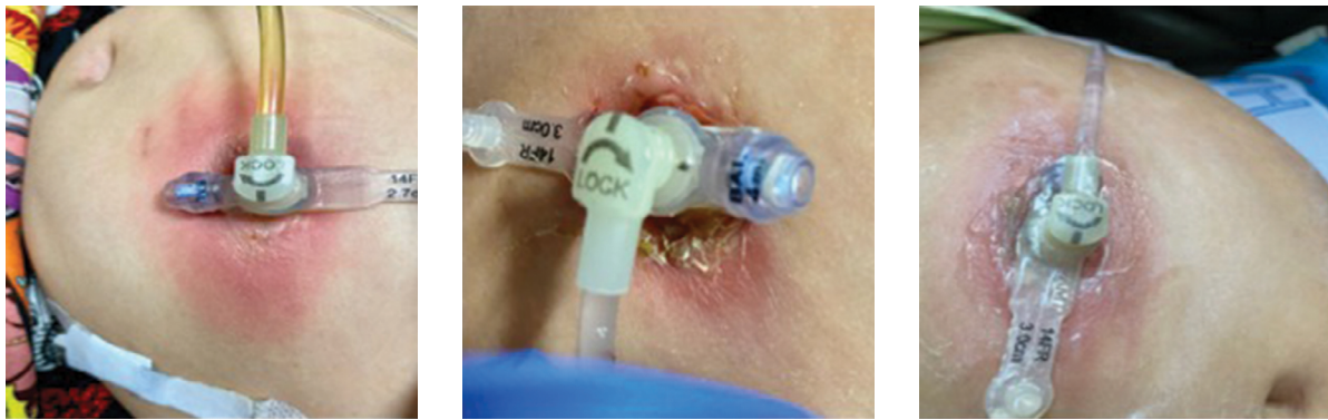
Figure 1. Images of gastrostomy tube erythema. Photographs shared with permission from patient/caregiver.

recommendations that will positively impact patient care (Lucendo et al., 2014; Zopf et al., 2008).